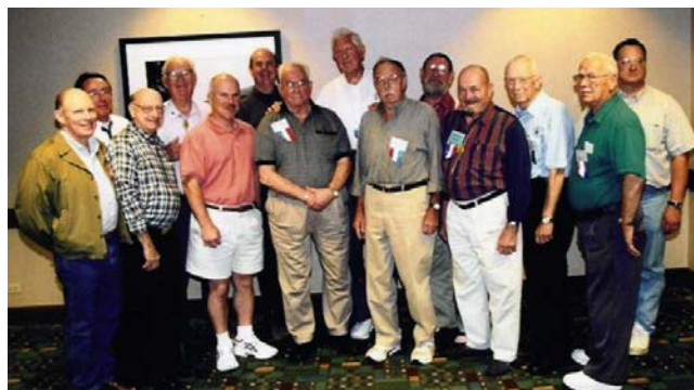
The 2005 Board of Directors