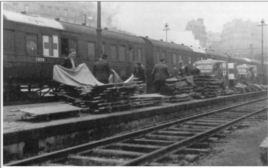
French civilian Litter Bearers are getting prepared to unload Hospital Train No. 13 at the Gare St.-Lazare, Paris, France, September 2, 1944