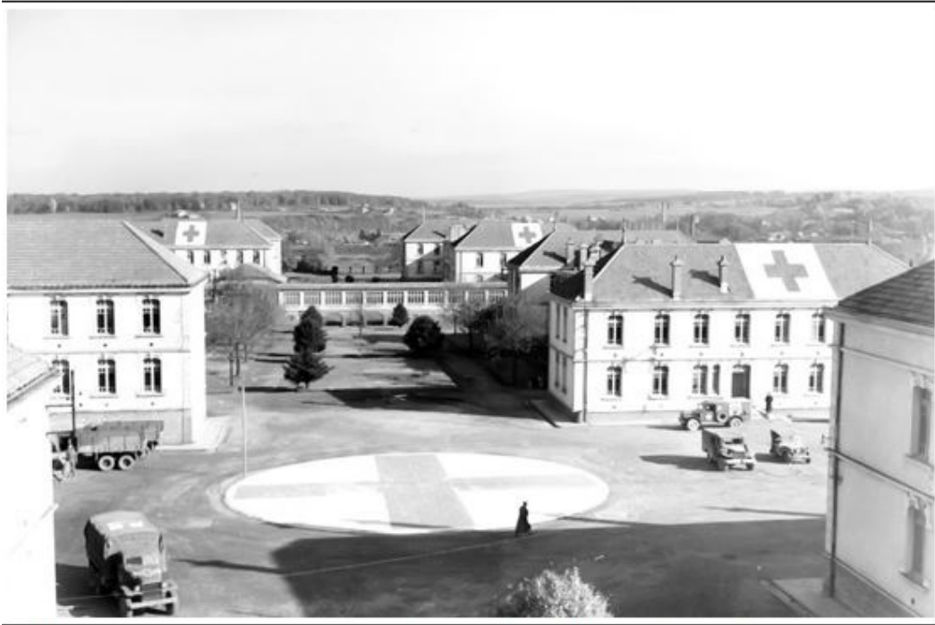
Illustration showing buildings and vehicles belonging to the 59th Evacuation Hospital in Epinal, France.